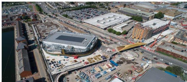
Arena - from the East

IP Gateway Review started with inception meeting