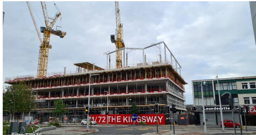
Galaxy S20+ 5G

IP Change Control Notification to be updated and formally submitted